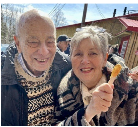
Out & About participants at cabane à sucre