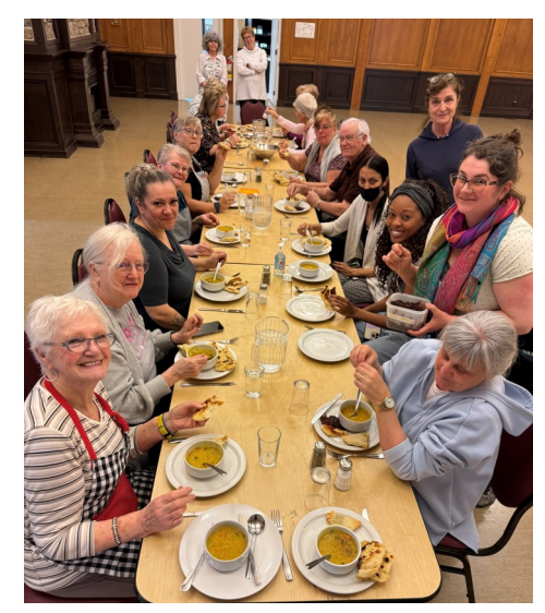
Participants learned how to cook Indian Cuisine at the Community Kitchen workshop in April