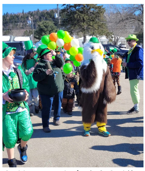
Participants preparing for the St. Patrick's celebration parade

lively spring scenes with watercolours in our community space. Air-dry clay workshops were also offered in April for both adults and children, with one final workshop planned for May 16 (for elementary students/ families).