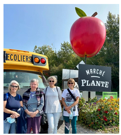
Marché Plante at Île d'Orléans

September and October were full of outings and benefited over 150 participants!