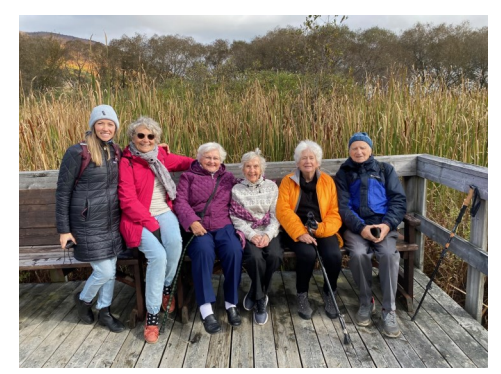
Cap Tourmente National Wildlife reserve

Fall is in full swing with Out & About activities, and what a beautiful warm fall we have had!