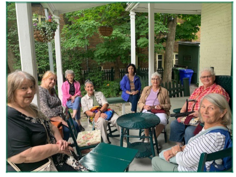
July 13—The Henry-Stuart House tour

July has been a busy month with 45 participants joining us on various outings. In the beginning of July, we enjoyed the beautiful